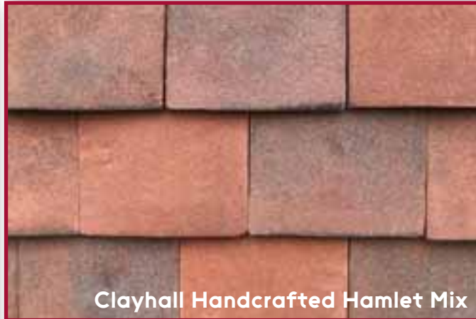
Clayhall Handcrafted Hamlet Mix