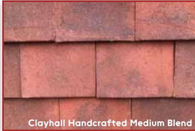
Clayhall Handcrafted Medium Blend