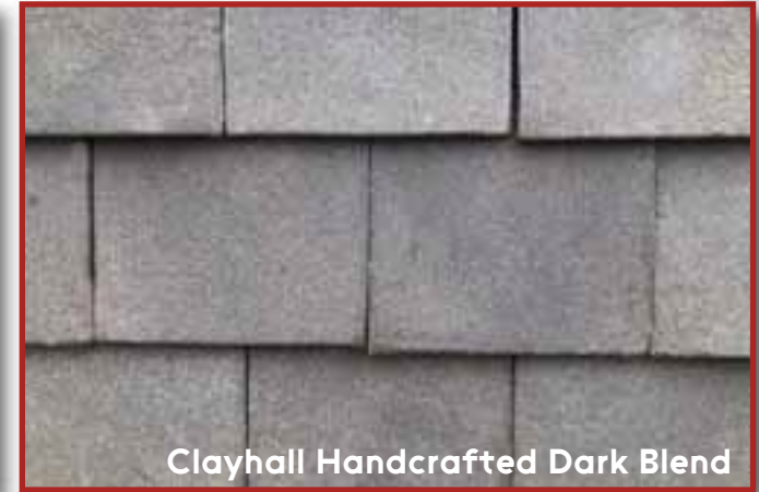
Clayhall Handcrafted Dark Blend