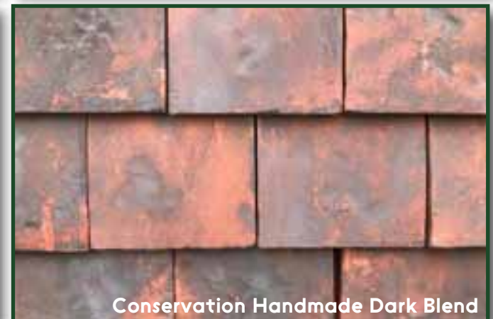
Conservation Handmade Dark Blend