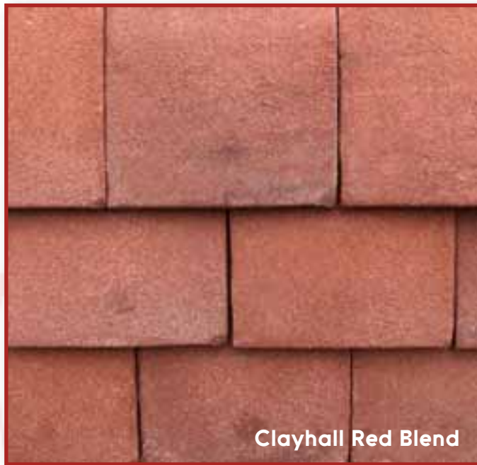
Clayhall Red Blend