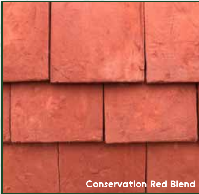
Conservation Red Blend