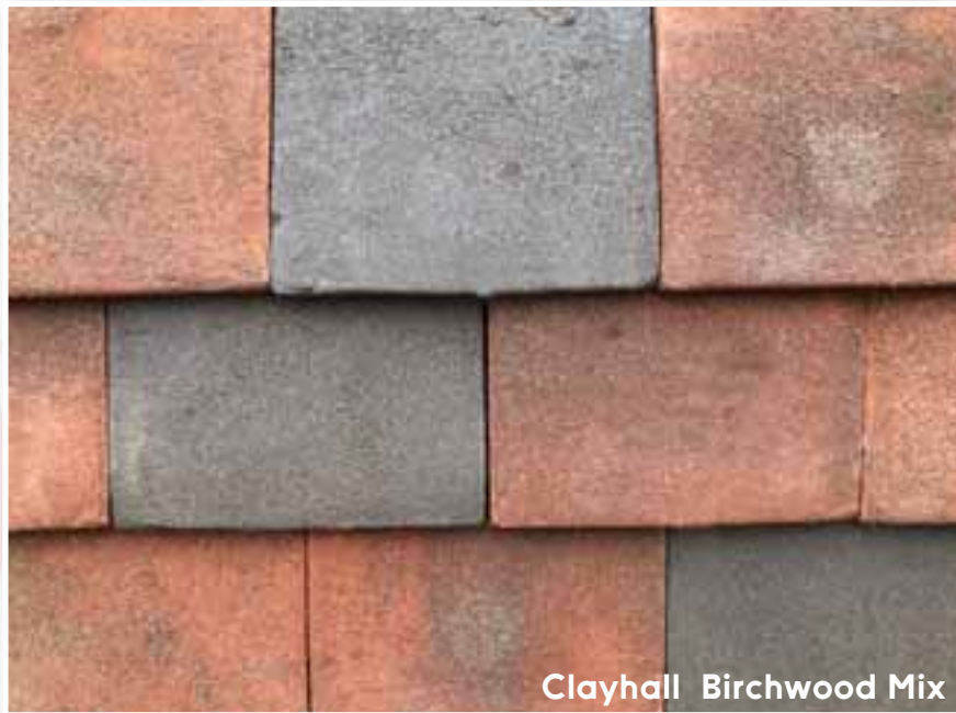
Clayhall Birchwood Mix

70% Clayhall Medium Blend 30% Clayhall Dark Blend