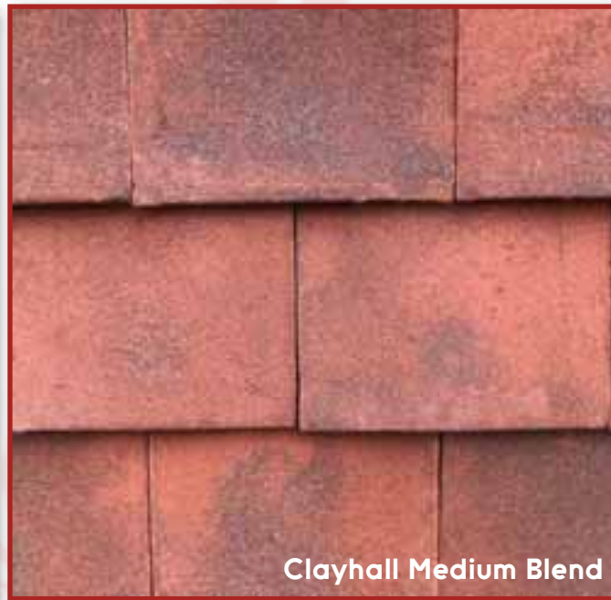
Clayhall Medium Blend