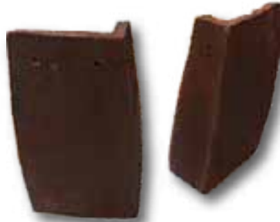
90 Degree External Angle