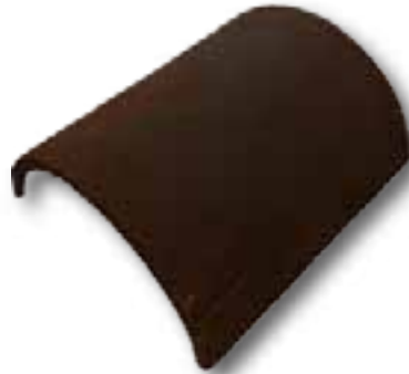
Half Round Ridge 300mm