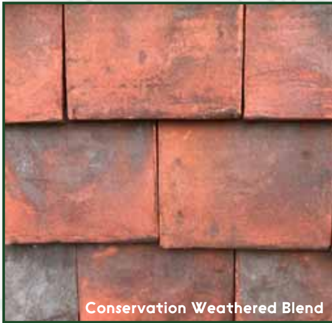
Conservation Weathered Blend