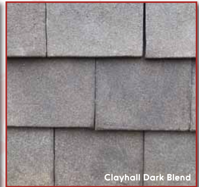
Clayhall Dark Blend

Our Clayhall Handcrafted Range consists of the following: