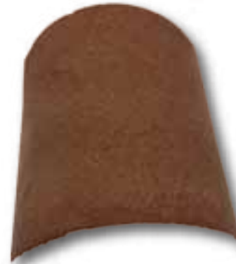
Third Round Ridge 300mm