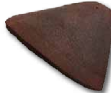
Universal Bonnet Hip