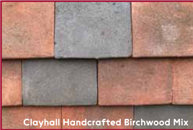
Clayhall Handcrafted Birchwood Mix