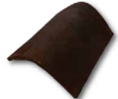
Hogs Back Ridge 300mm