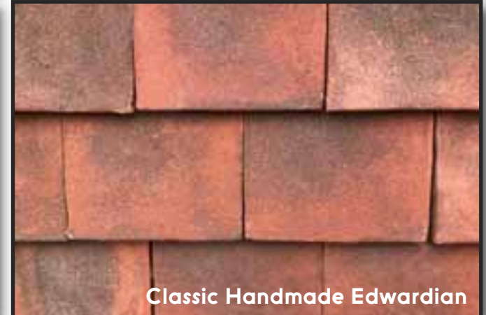
Classic Handmade Edwardian