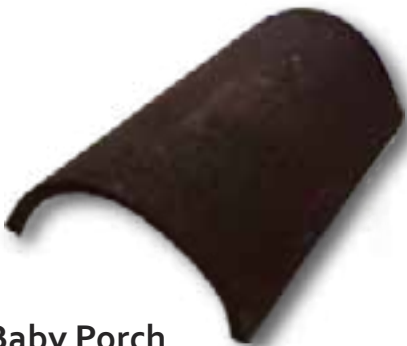
Baby Porch Ridge 300mm