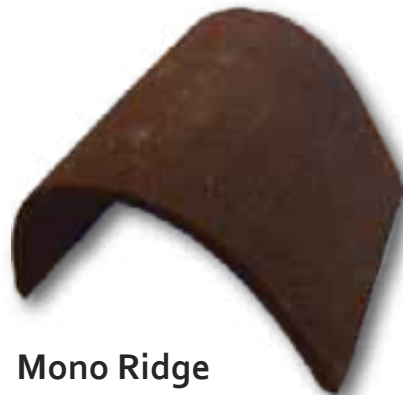
Mono Ridge 300mm