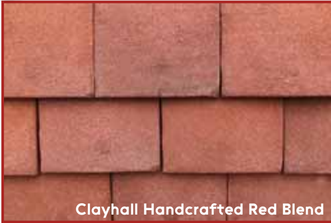
Clayhall Handcrafted Red Blend