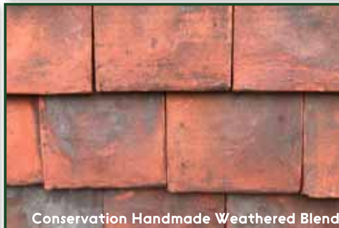
Conservation Handmade Weathered Blend