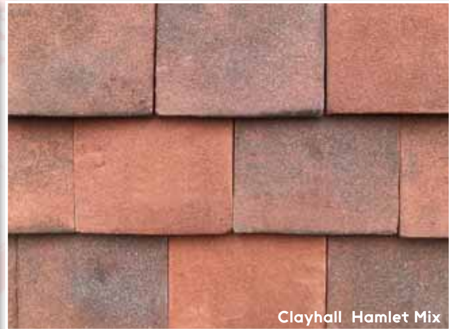
Clayhall Hamlet Mix

70% Clayhall Medium Blend 30% Clayhall Dark Blend