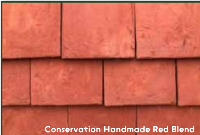
Conservation Handmade Red Blend