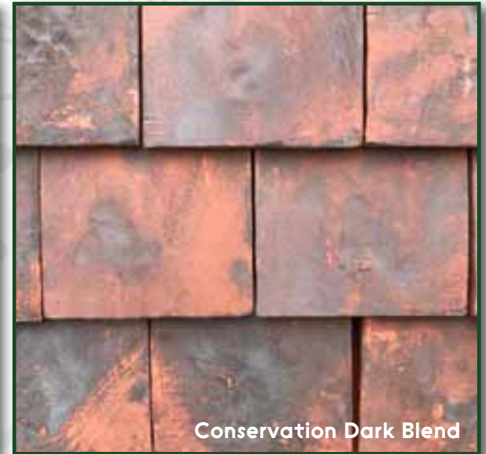
Conservation Dark Blend

Available in three distinctive colours, created by using a very fine sand,